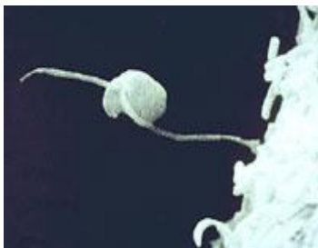
Figure 3. Zoopsore with biflagellate flagellum and sporangia (Jean Ristaino, Gail L. Schumann, Cleora J. D'Arcy)

According to Nowicki, Foolad, Nowakowska, & Kozik, (2012) phytophthora infestans persists between potato crops as mycelium in infected tubers or tomato fruit in the absence of the oospore stage. Sporangia may be developed on diseased tubers or new volunteer sprouts that appear the following spring if they are left behind at harvest or thrown at the boundaries of fields. Sporangia sporangia sporangia sporangia sporangia sporangia sporangia Seed potatoes can become infected, resulting in stem lesions that can kill the plant (Figure 4); freshly cut seed tuber surfaces are particularly vulnerable to infections from airborne spores in contaminated storage facilities. Local infection can arise if infected seed is planted. The virus spreads by moving through infected tuber tissues, and clonal lineage asexual reproduction is common (see Disease Cycle) (Figure 5).