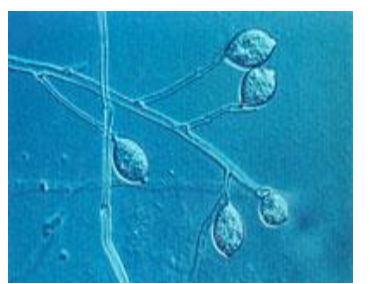
Figure 1. Compound sporangiophore

on their own (Figure 2). Zoospores are biflagellate (have two flagella) (Figure 3), with one tinsel and one whiplash flagellum pointed anteriorly and posteriorly, respectively. Zoospores encyst and infect the plant after swimming on the surface of the host plant.