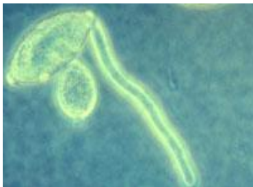
Figure 2. Germinating sporangia