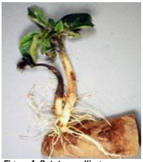
Figure 4. Potato seedling