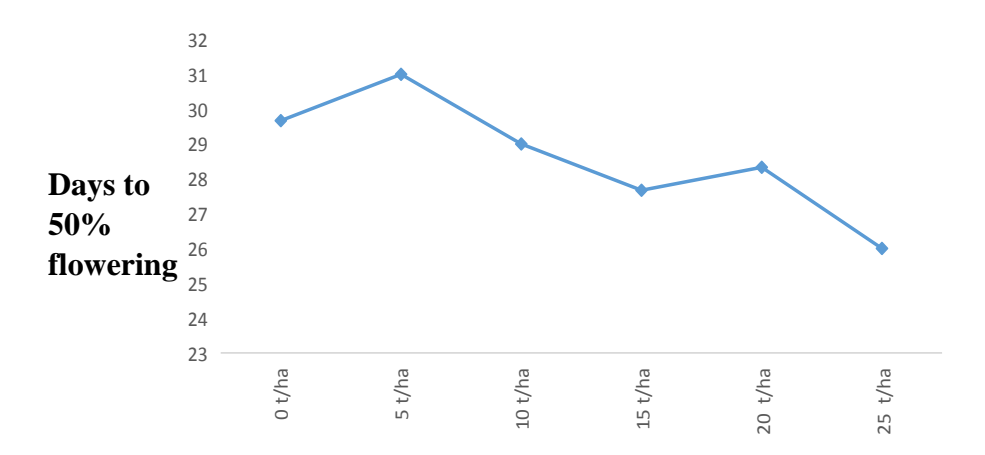
Figure 1: Effects of different levels of pig manure on the days to 50% flowering of cucumber plants.

The result in Figure 1 shows that different rates of pig manure had significant effects (p< 0.05) on number of days to 50% flowering. From the result cucumber planted on plots amended with 25 t/ha<sup>-1</sup> flowered earlier than other plots; closely followed by t/ha<sup>-1</sup>, 20 t/ha<sup>-1</sup>, 10 t/ha<sup>-1</sup> while 5 t/ha<sup>-1</sup> and control plots flowered late. This was in accordance with Abd-Allah et.al. , 2001; Bayoumi, 2005; Ehaliotis et.al. , 2005; who reported that Fe, Zn and Mn encourages vegetative growth, total chlorophyll and the photosynthetic rate of plants which enhance early flowering and fruiting, leading to an increase early fruit maturity.