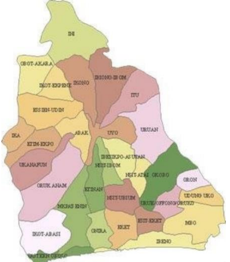
Figure 3: Map of Akwa Ibom State showing the 31 Local Government Areas (Udotong, Udoudo and Udotong, 2017: 30)

Figure 3 that follows is the political map of Akwa Ibom State showing the 31 local government areas.